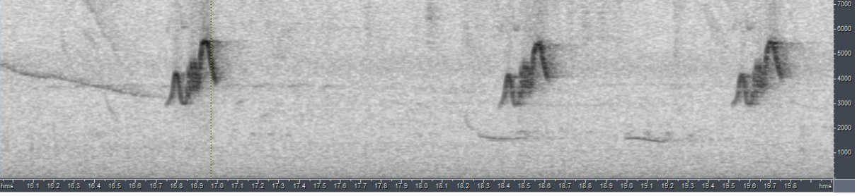
Figure 1: typical dawn song of race frantzi